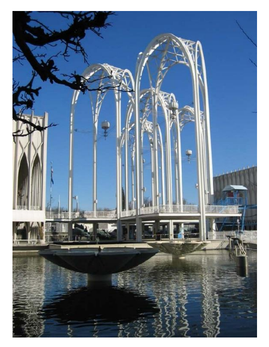
Pacific Science Center, 200 2<sup>nd</sup> Avenue North, 2010