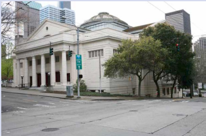
Contemporary photo, 2013