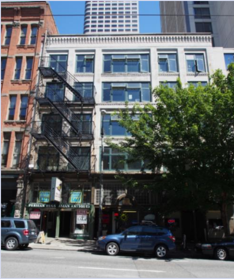
Contemporary photo, 2014