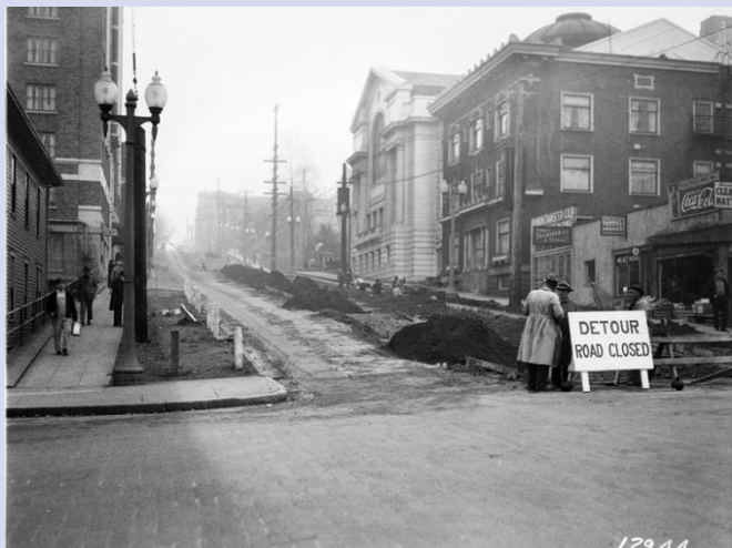
Historic photo, 1935