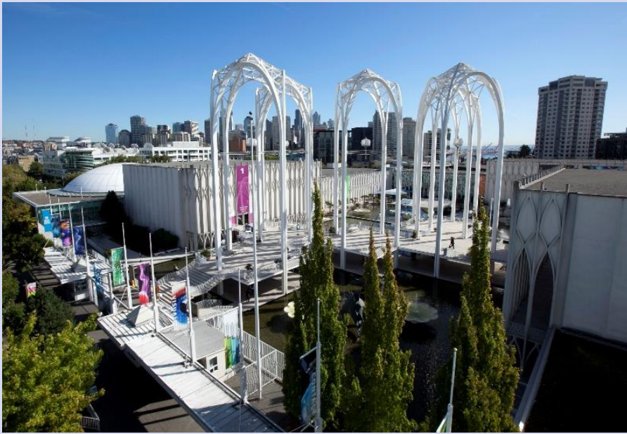
Contemporary photo, 2012