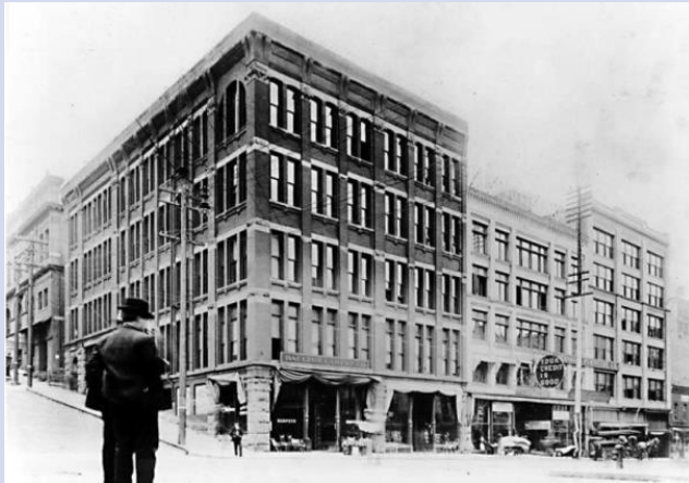
Historic photo, 1905