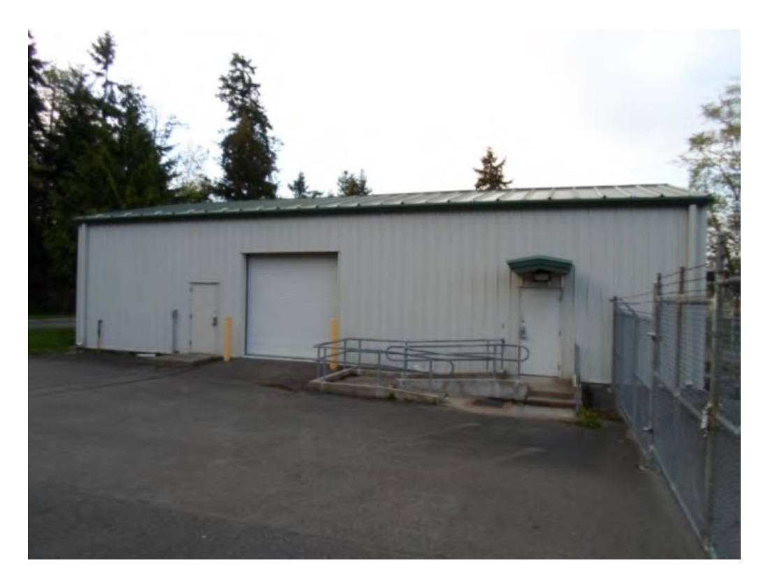
Building 211 / Unheated Storage (6,000 sq. ft.)