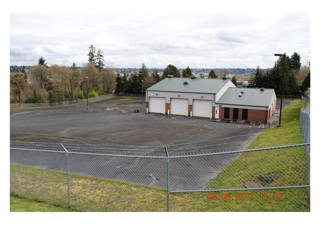
AMSA 222 / Maintenance Shop (6,400 sq. ft.)