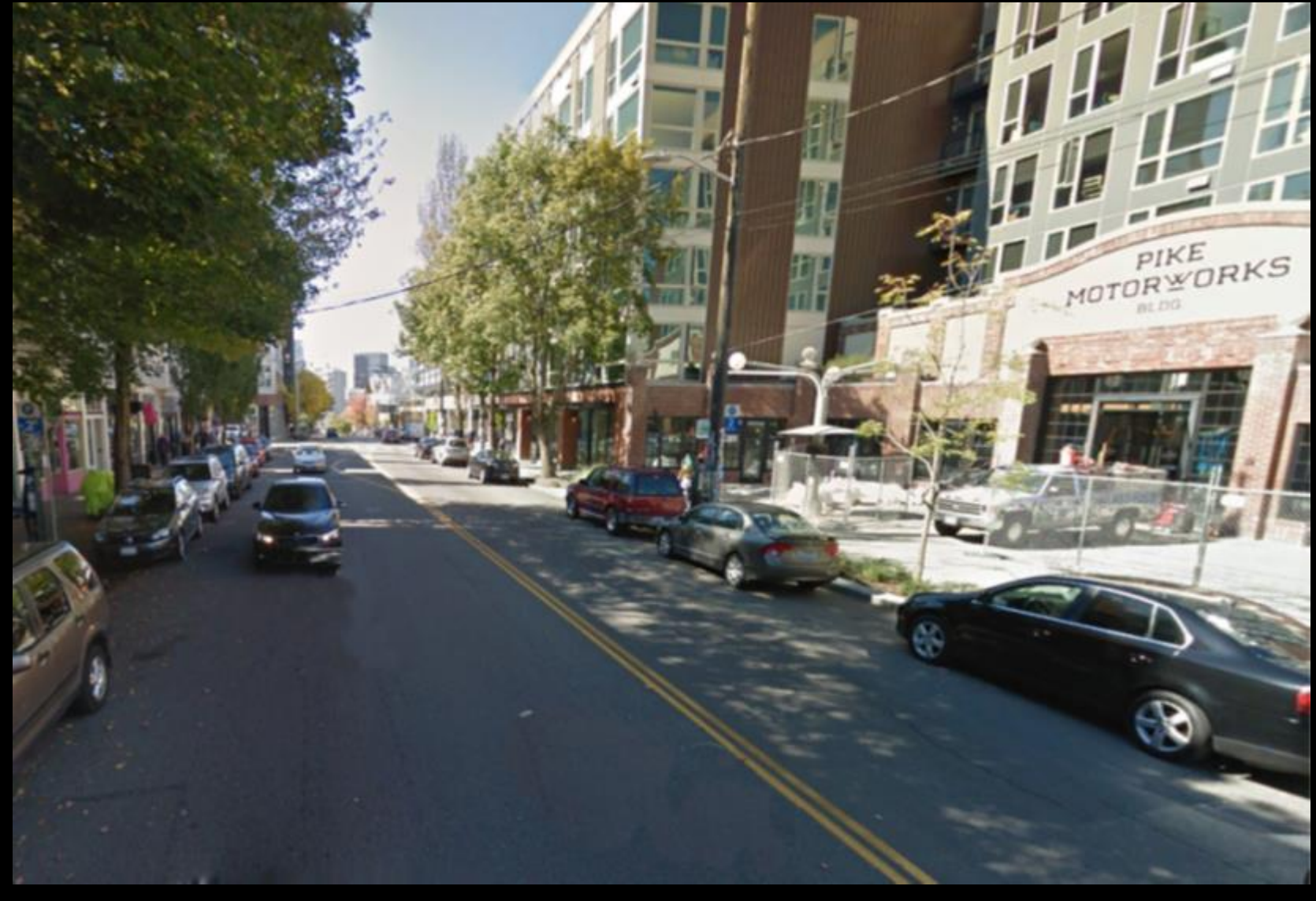
Pike / Pine