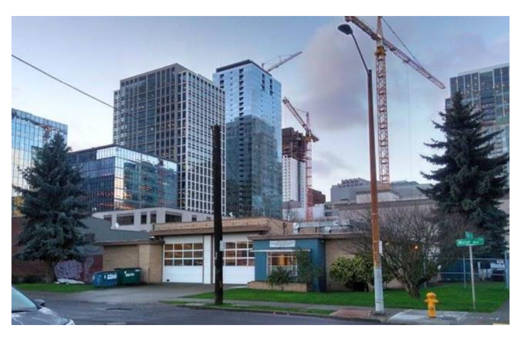
1933 Minor Avenue