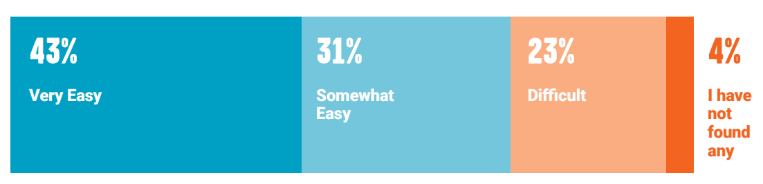
(Q11) How easy is it to find information about elections and candidates in your preferred language?

Latino respondents, by a wide margin, did not have significant difficulty attaining linguistically accessible information about elections, with 74% finding it either "very easy" or "somewhat easy". This is in contrast to East Africans and Asian Americans, who come from a wide range of linguistic backgrounds, some of whom depend more heavily on oral traditions of communicating.