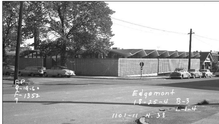
Historic photo, 1960