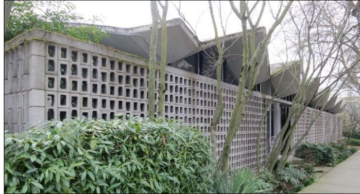
Contemporary photo, 2017

Structural Engineer: Worthington Skilling Helle & Jackson