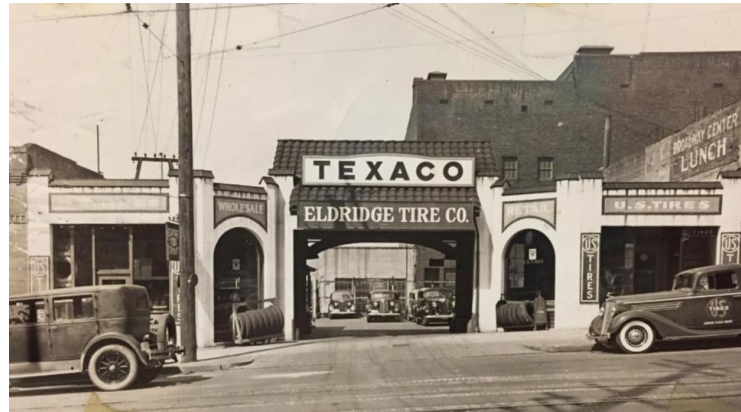
Historic photo, 1937