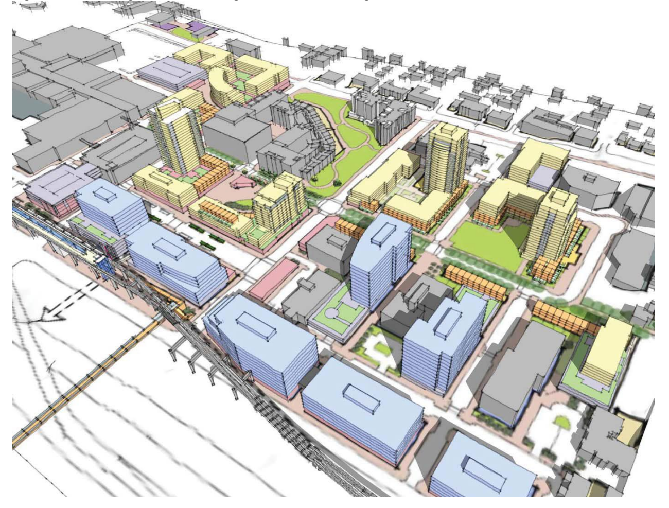
Figure 5. Rendering from the Northgate TOD Urban Design Framework

Figure 5 shows a rendering from the 2012 Northgate TOD Urban Design Framework that illustrates the character and scale of development envisioned for the Northgate TOD area. Proposed development standards resemble those evaluated in this Framework, and the development above is one example of a potential scenario that could occur under the proposed legislation.