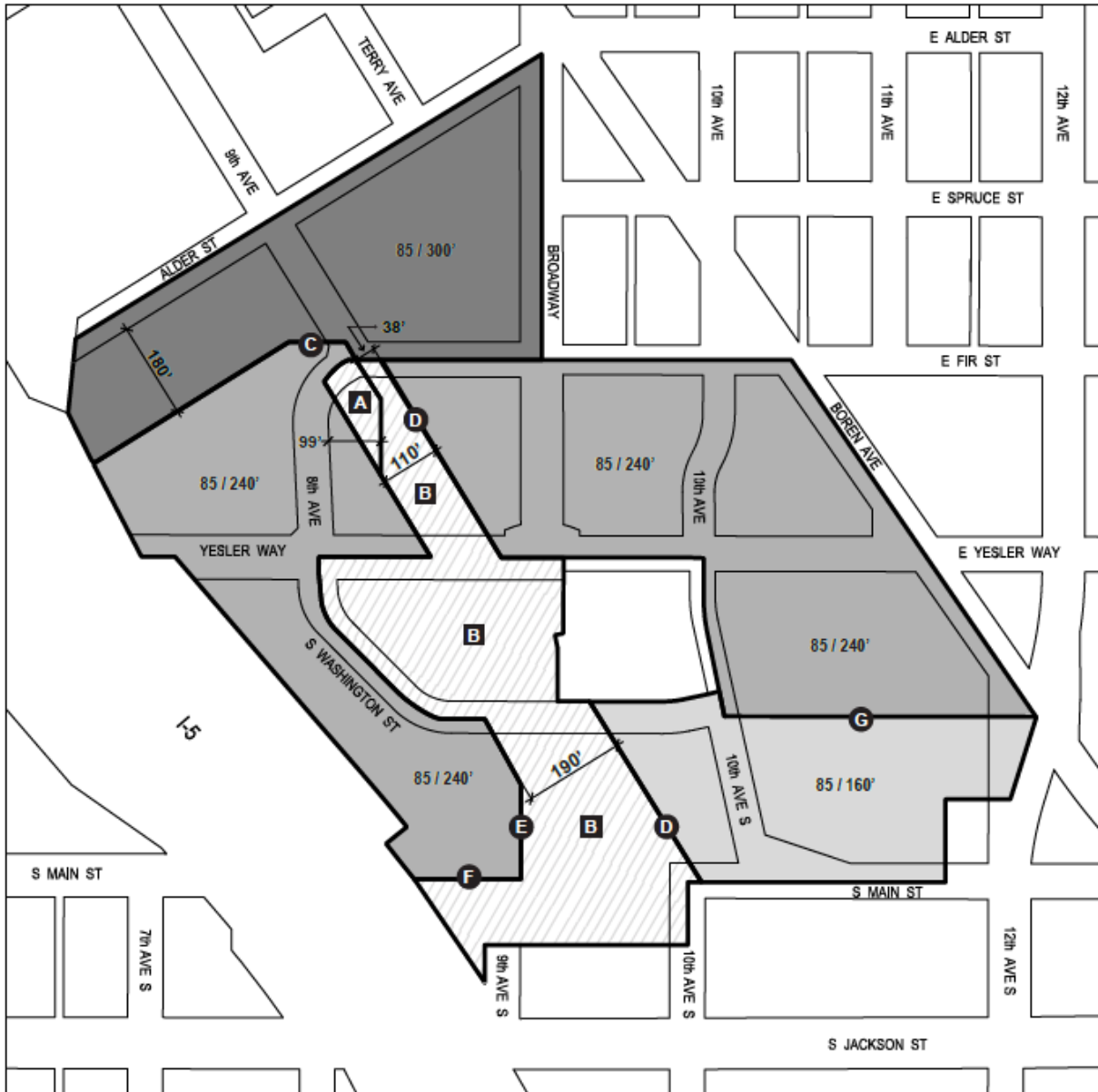
Exhibit A for Section 23.75.100 Height limits