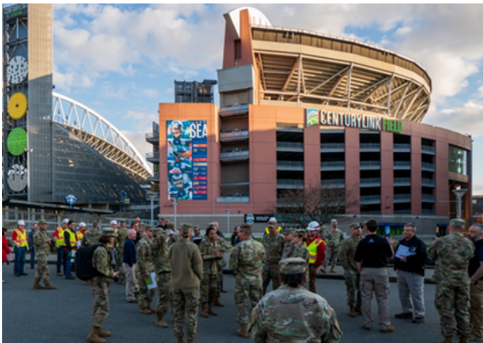
Top: Inside the mobile field hospital established at Lumen Center. Bottom: National Guard soldiers are briefed before staffing the mobile field hospital.

OEM worked with representatives from Century Link along with elements of the US Army including the 62nd Medical Brigade, The 10th Field Hospital ("Mountain Medics"), the 902nd Contracting Battalion and the State Emergency Management Division to get the 171 bed hospital up and running.