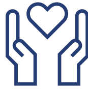
HOMELESSNESS & HUMAN SERVICES