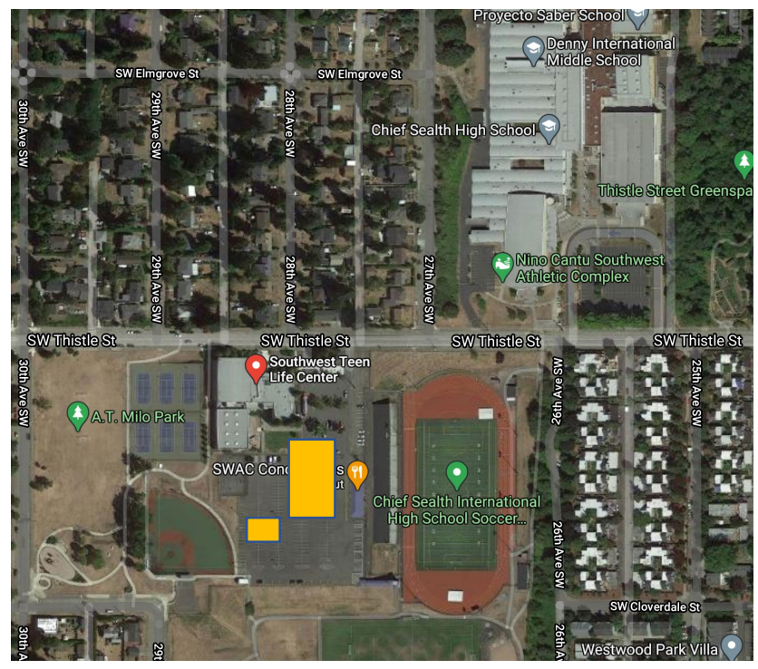
SPS owns Chief Sealth HS parking lot south of SW Teen Life Center and Pool