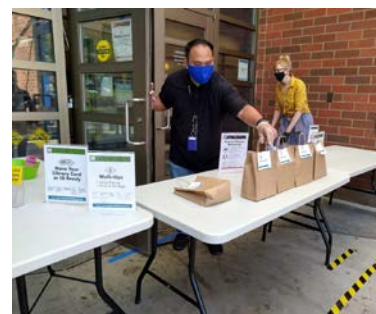
Curbside Pickup – Rainier Beach Branch

Soon after the COVID-19 closure, we began planning how we could again safely loan physical materials to our patrons. In July, we began accepting material returns at select locations, and in August, after several months of planning, we launched a new service model: a no-contact Curbside Pickup Service at locations throughout the city: Ballard, Broadview, Douglass-Truth, High Point, Lake City, Rainier Beach branches and at the Central Library. When holds were available, patrons could either schedule an appointment or simply walk up to collect their books outside through contactless experience. We also resumed Mobile Services deliveries in August, providing books and materials once again to homebound seniors, people living with disabilities and preschool children living in low-income households.