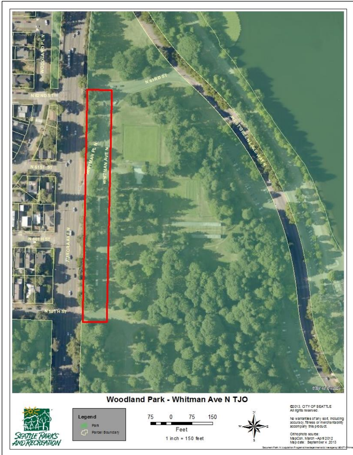
Exhibit A Whitman Avenue N Transfer of Jurisdiction Map