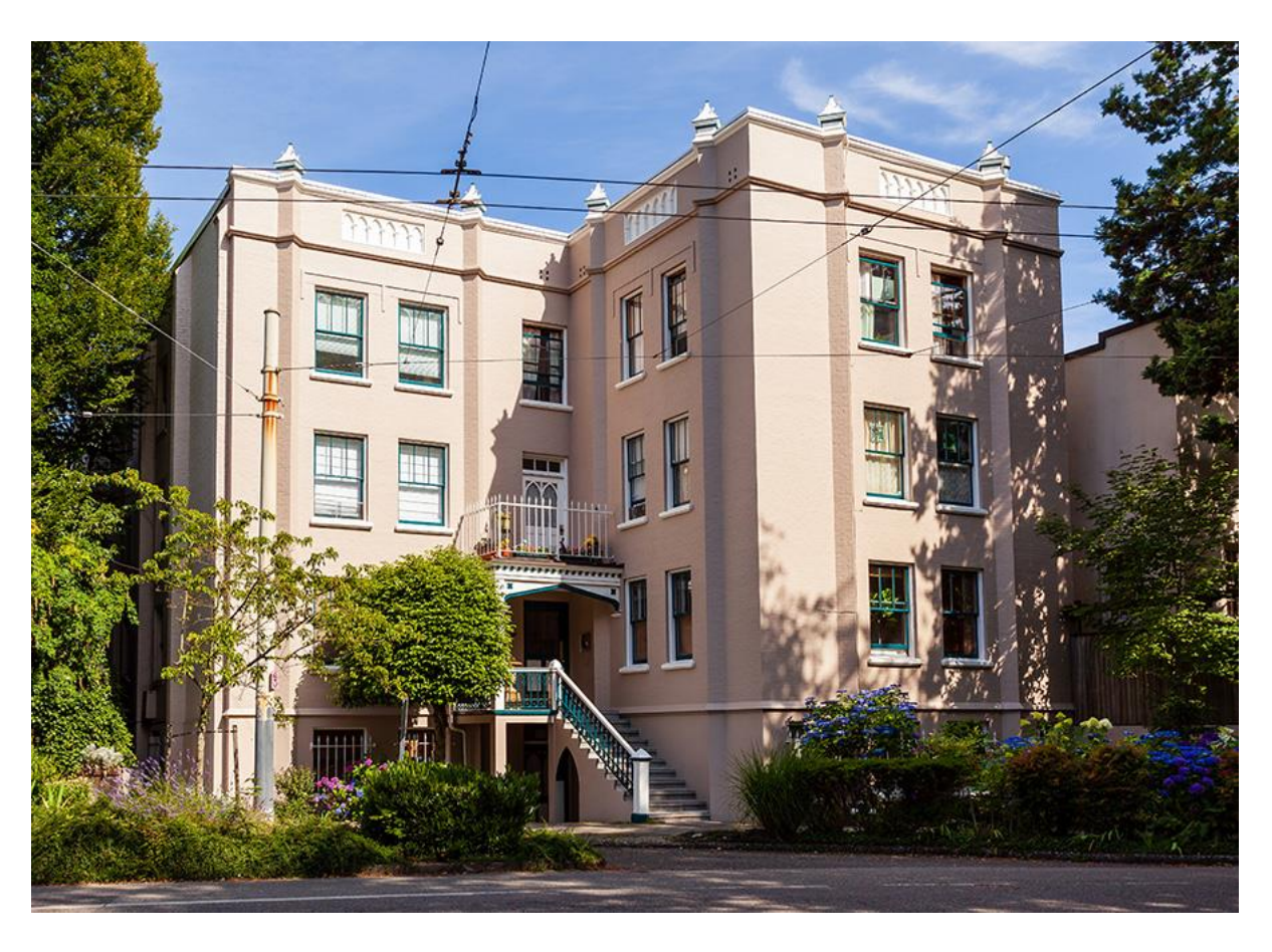
The Fairfax, 1508 10th Avenue E, 2020