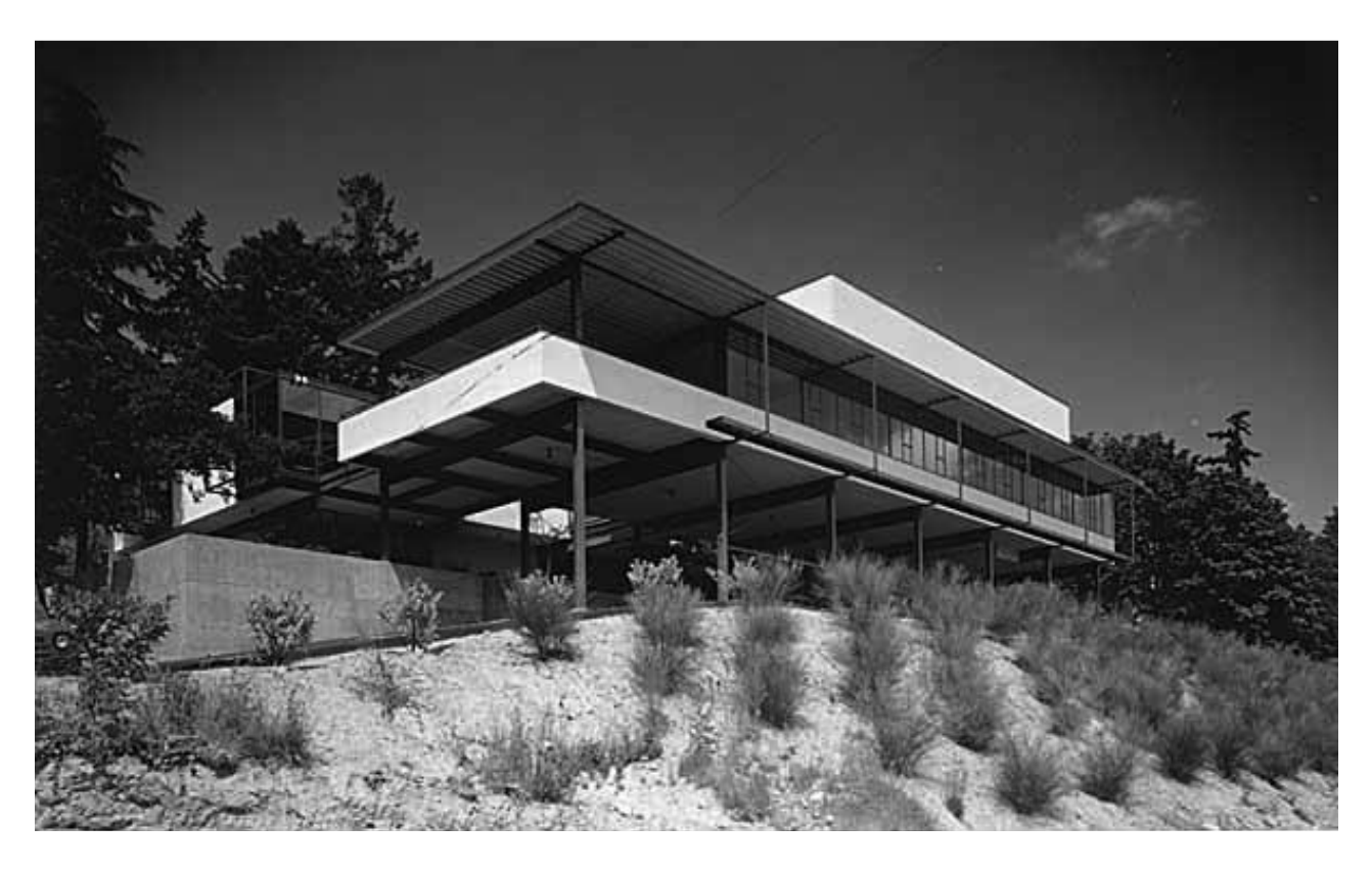
University of Washington Faculty Club, 4020 E Stevens Way NE, 1960