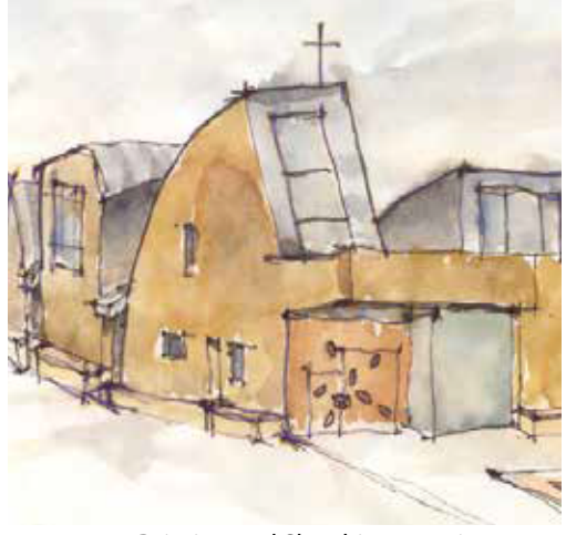
Painting and Sketching ongoing pen, pencil, watercolor and encaustic