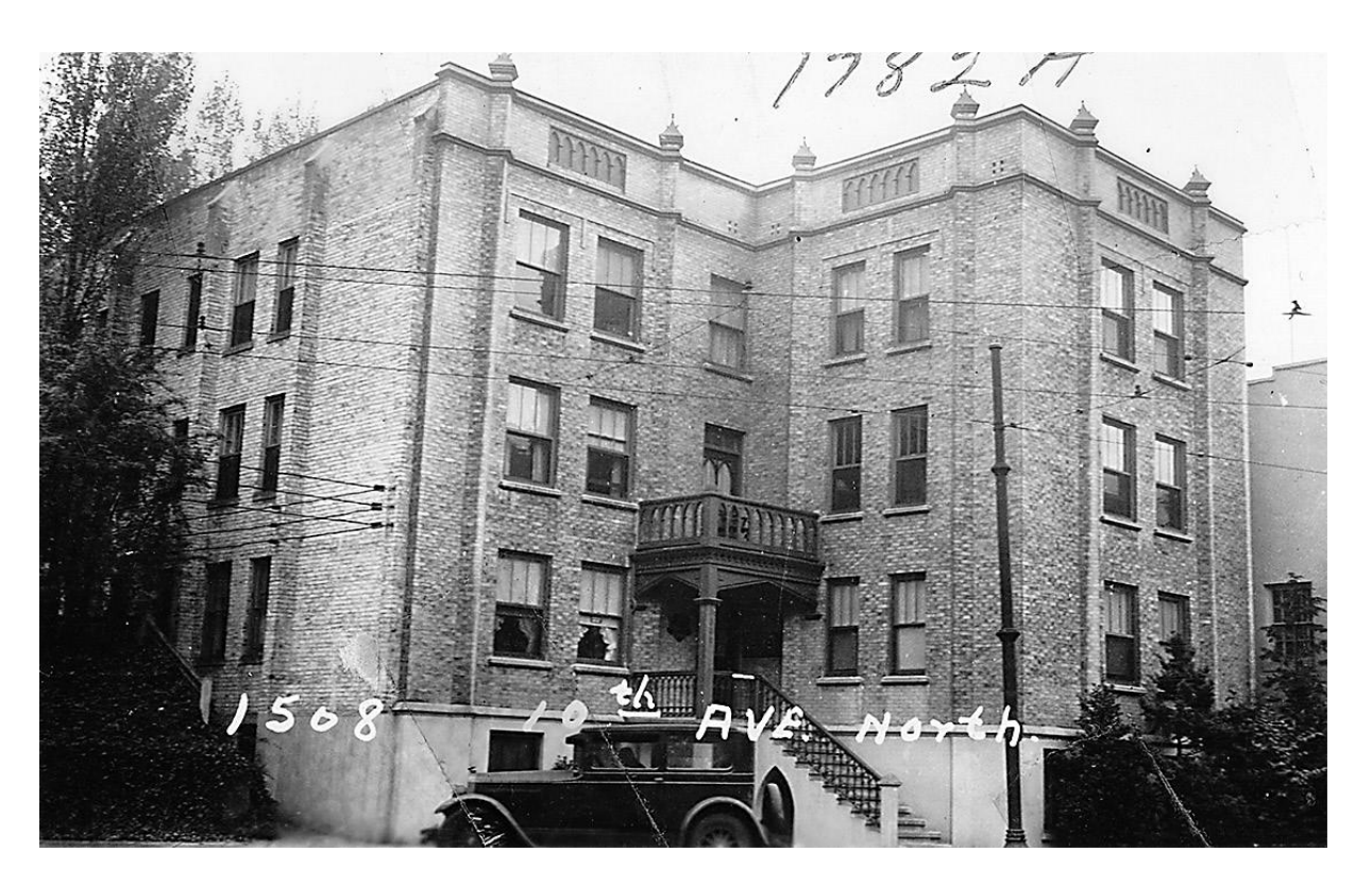
The Fairfax, 1508 10th Avenue E, 1937