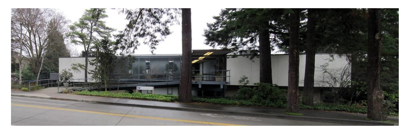
University of Washington Faculty Club , 4020 E Stevens Way NE, 2013