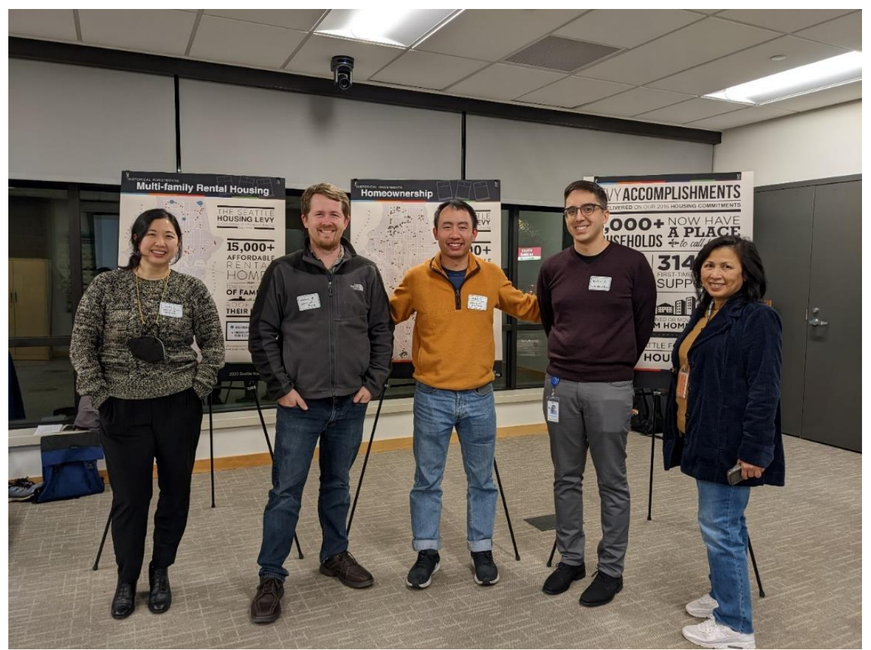
Housing Levy Open House at Hobson Place, December 6, 2022