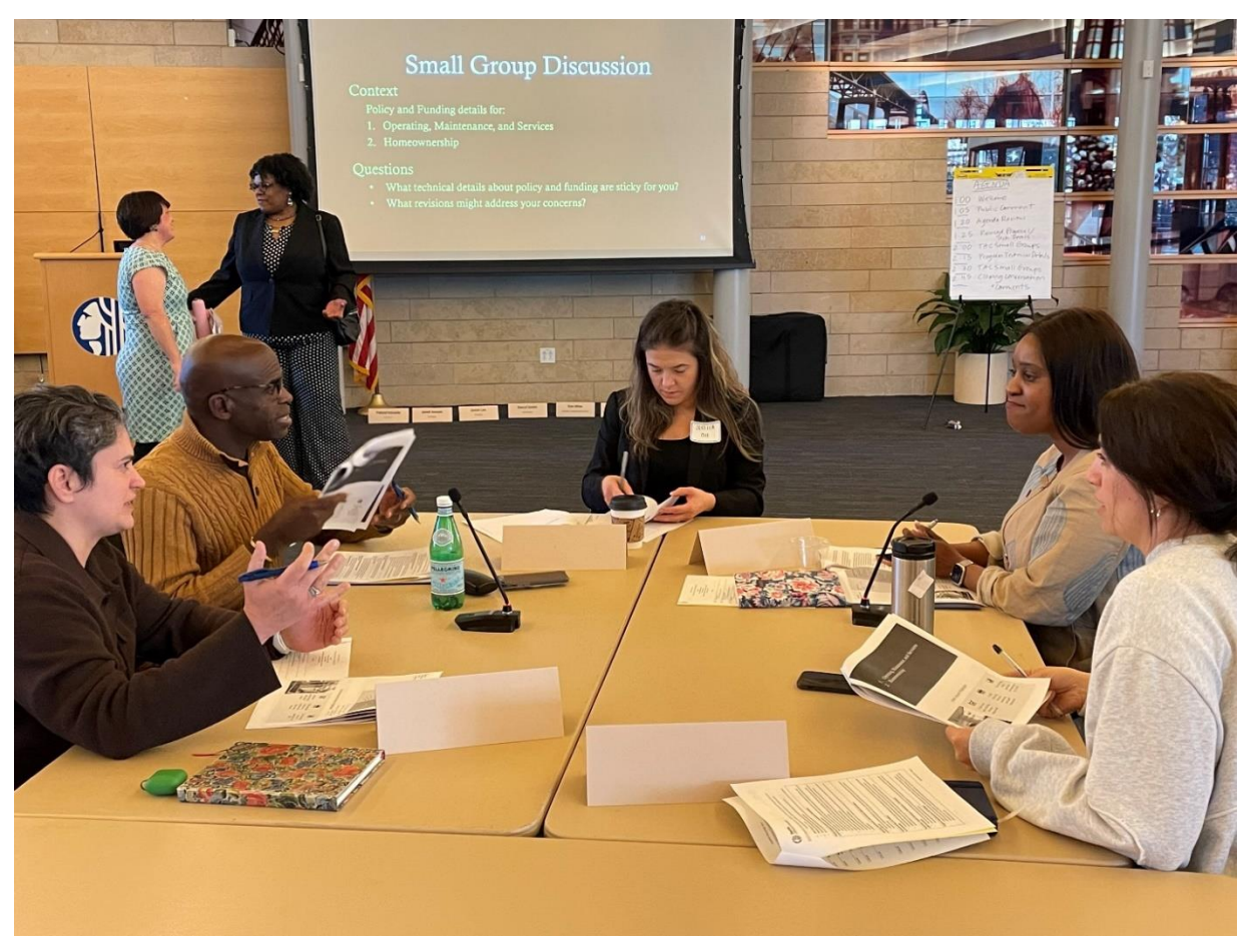
Housing Levy Technical Advisory Committee meeting, November 18, 2022