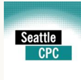
Civil Liberties (Vacant) Appointed by CPC