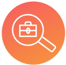
Job Training and Placement