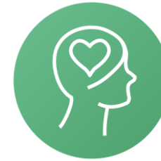
Behavioral Health Services