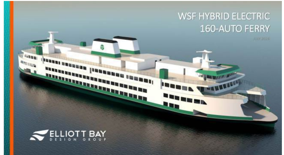
Preliminary 3-D-rendering of the new hybrid-electric 160-auto-capacity ferry.