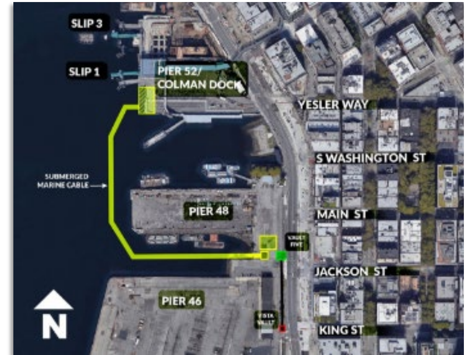
Project Area, showing submarine cable in yellow. Photo from the Nov 2021 WSF CRA Workshop Final Report