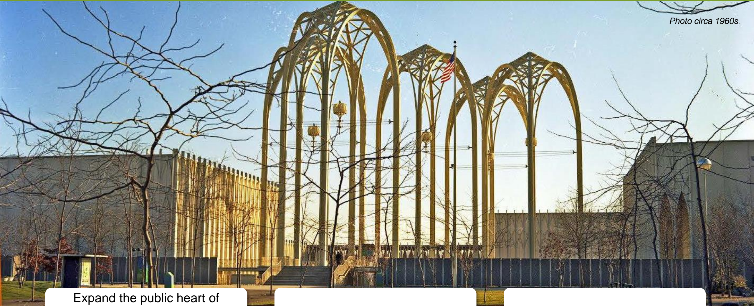
Photo circa 1960s

Expand the public heart of campus to the iconic Pacific Science Center courtyards and arches