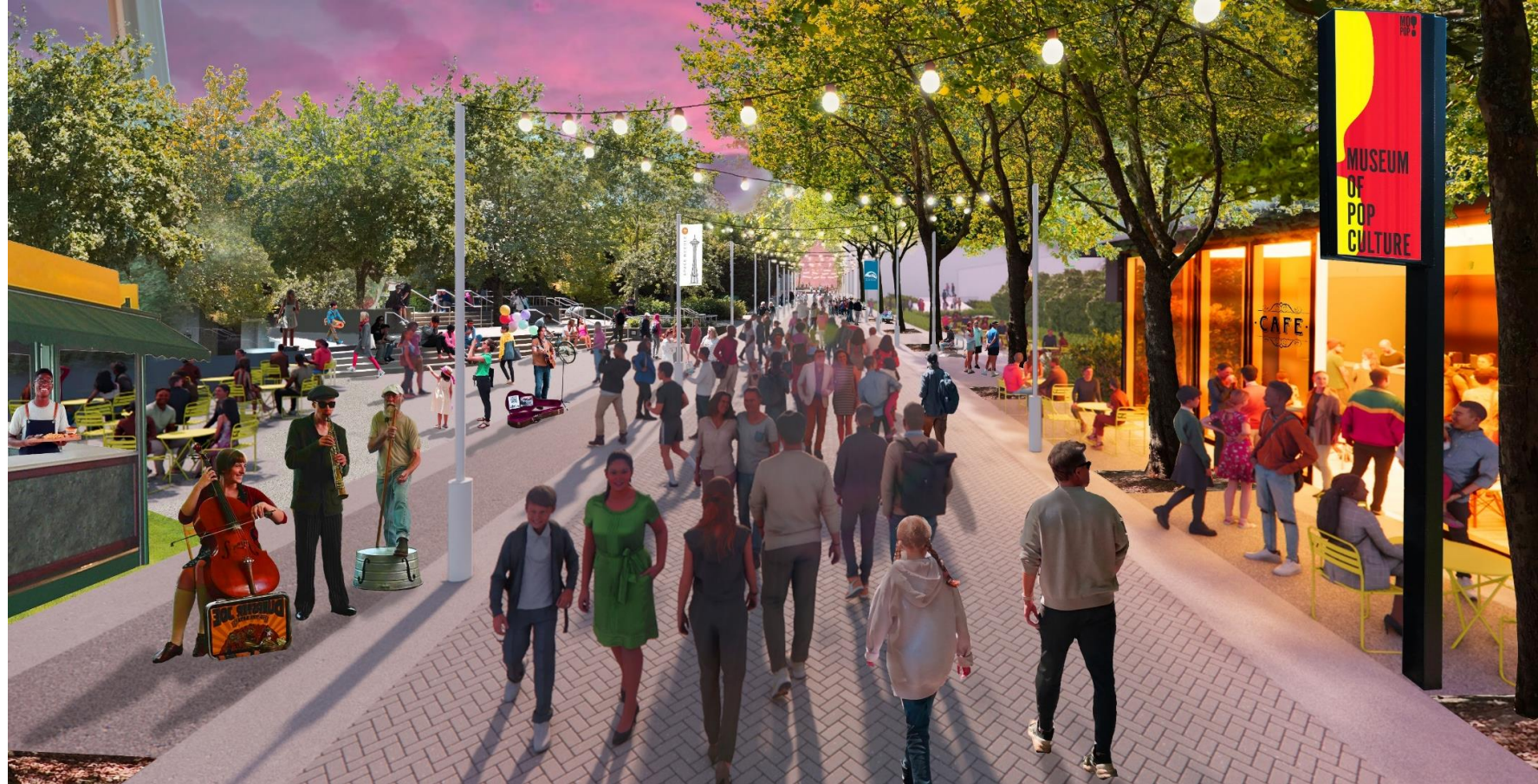
Future Thomas Street gateway concept

Mark campus gateways with public artwork and landscaping