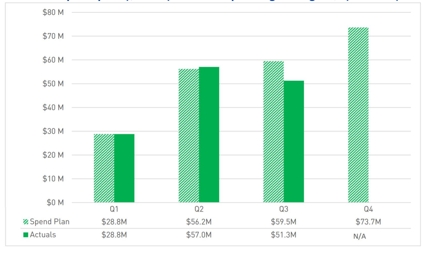
2019 spend plan ($218M) vs actual spending through Q3 (all funds)

Actuals are through Q3 2019 (Source: 2018 Annual Report and 2019 Q3 report) Cumulative levy totals through end of 2019 will be published in 2019 Annual Report on March 30, 2020